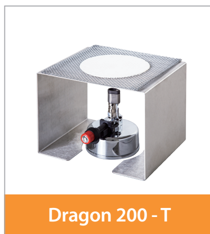
Dragon 200 - T