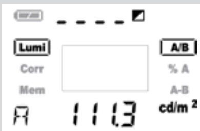
Read-out in the display of luminance measurement

A data memory for storing up to 1000 single measuring values, which can be subdivided into 10 groups, is available in the MAVO-SPOT 2 USB . The memory data can be visualized and processed directly with the keyboard and the display or also in the PC via USB Port and the included standard software.