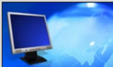
Measuring the reflections at monitors