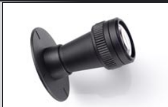
Measuring probe for contact measurements