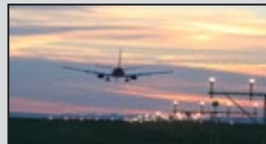
Measuring airfield guidance lights