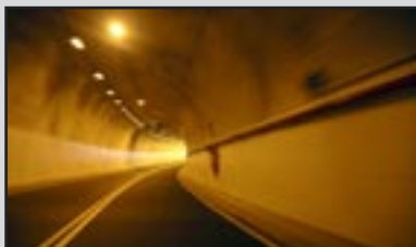
Lighting of tunnels