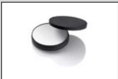
GOSSEN Reflexion Standard