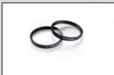
Close-up lenses 1 and 2