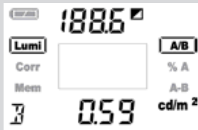
Luminance ratio measurement A/B