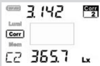
Lux measurement with Reflexion Standard