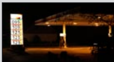
Measuring light immissions