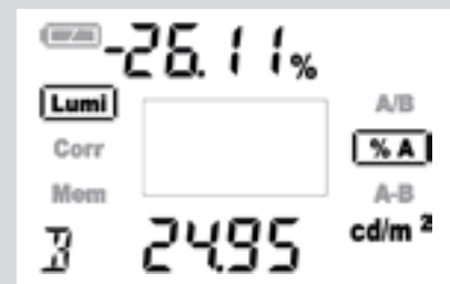
Luminance ratio measurement percentage % A