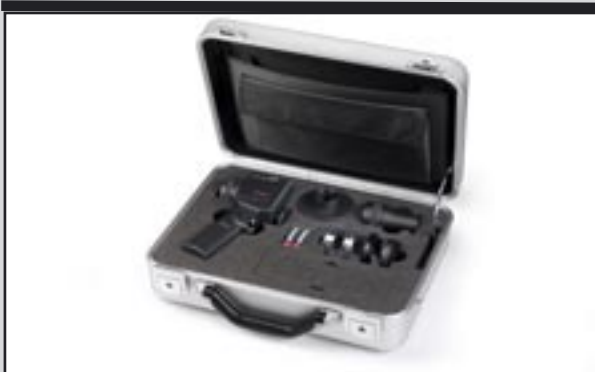
The MAVO-SPOT 2 USB is supplied in a practical, strong aluminum transport case