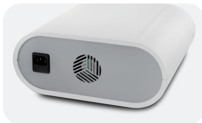
Low-noise, High-efficiency cooling fan