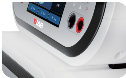
Anti-slip groove design