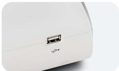
Real-time data recording