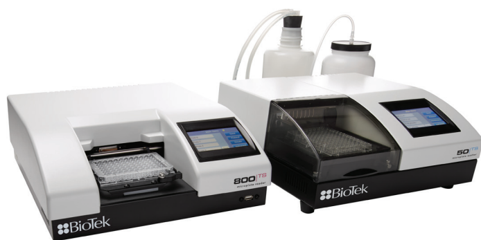
BioTek's 800™ TS Reader is ideal for pairing with 50™ TS Washer for routine workflows.