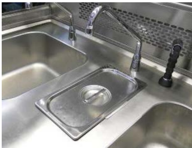
Cover for formalin sink