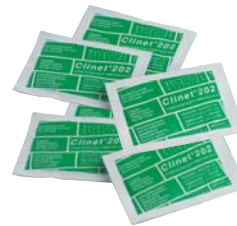
Clinet® 202 Disinfecting wipes in individual pack Ref.: 310 202