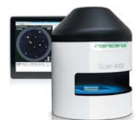
Scan® Automatic colony counters Inhibition zone readers