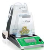
DiluFlow® Gravimetric dilutors