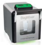
BagMixer® Lab blenders