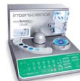
easySpiral Dilute® Automatic diluter and platers